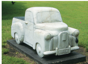
New Farm Park