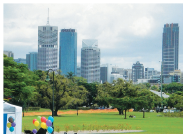
City views from New Farm Park