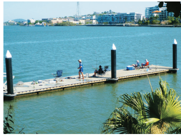
Optimists fishing in the Brisbane River