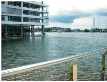
Newstead Riverpark apartments